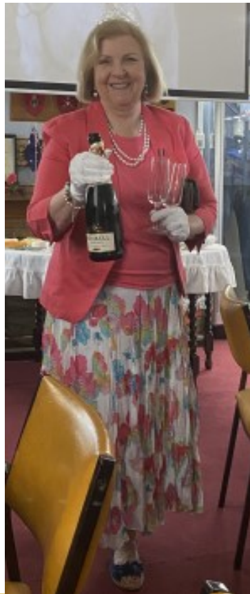
AND WE THANKED THE QUEEN FOR HER SERVICE IN OUR OWN WAY