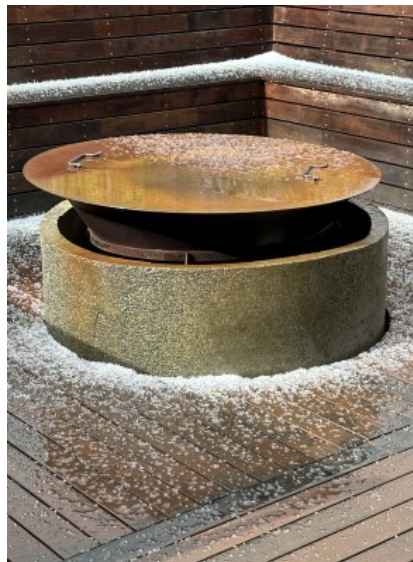
This is the fire pit where we usually sit after dinner with a bevvv