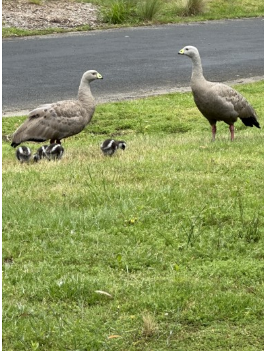
The only lovely day we had, the day we arrived