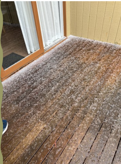
This is our entrance where we don't usually have to worry about hail getting inside