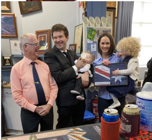
WE LOST A LONG TIME MEMBER THIS PAST YEAR